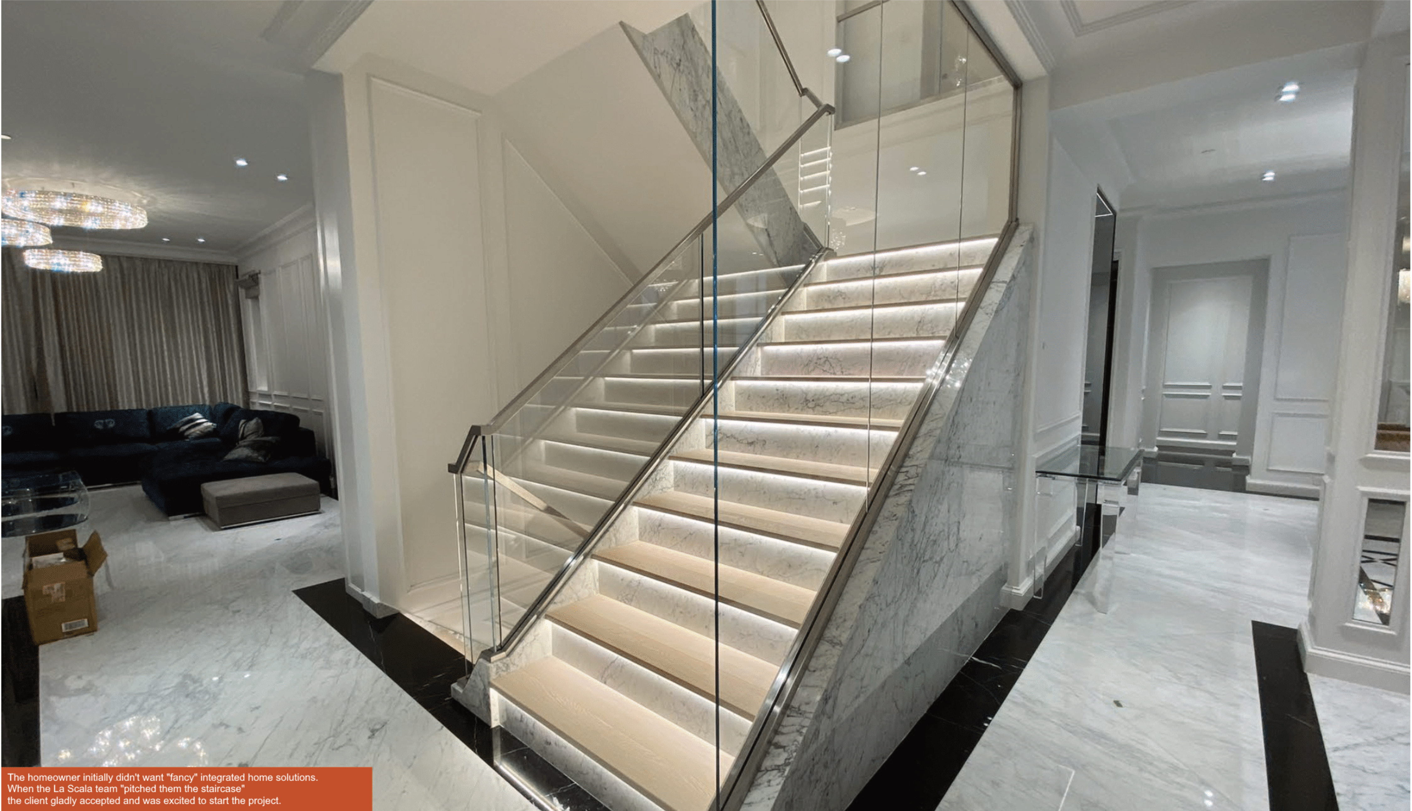
The homeowner initially didn't want "fancy" integrated home solutions. When the La Scala team "pitched them the staircase" the client gladly accepted and was excited to start the project.