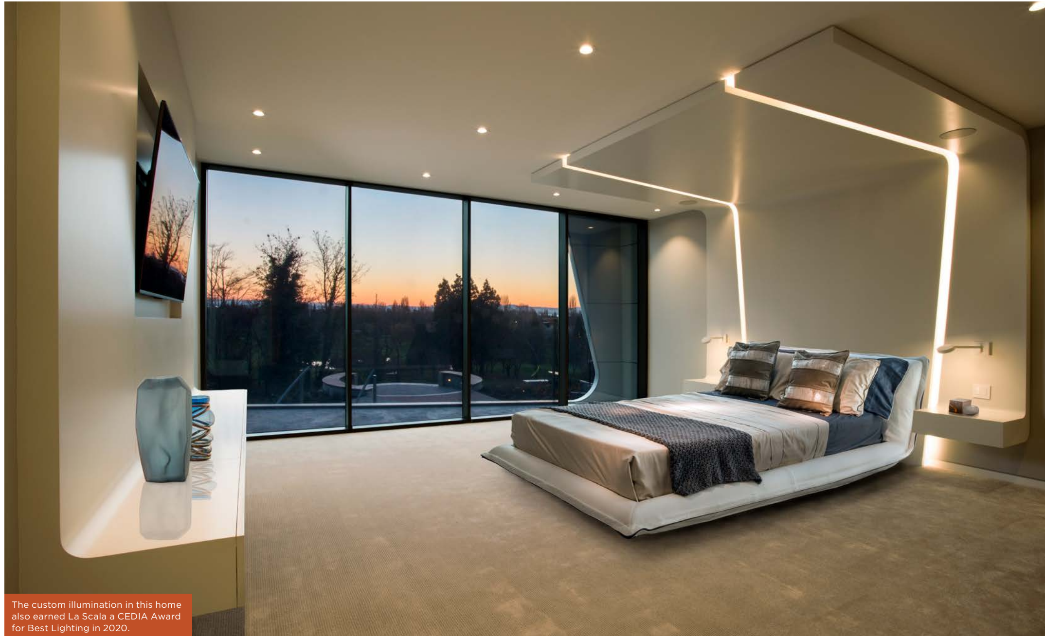
The custom illumination in this home also earned La Scala a CEDIA Award for Best Lighting in 2020.