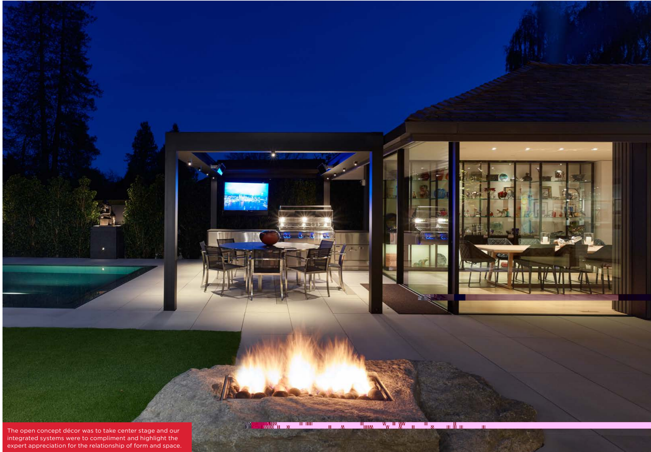
The open concept décor was to take center stage and our integrated systems were to compliment and highlight the expert appreciation for the relationship of form and space.