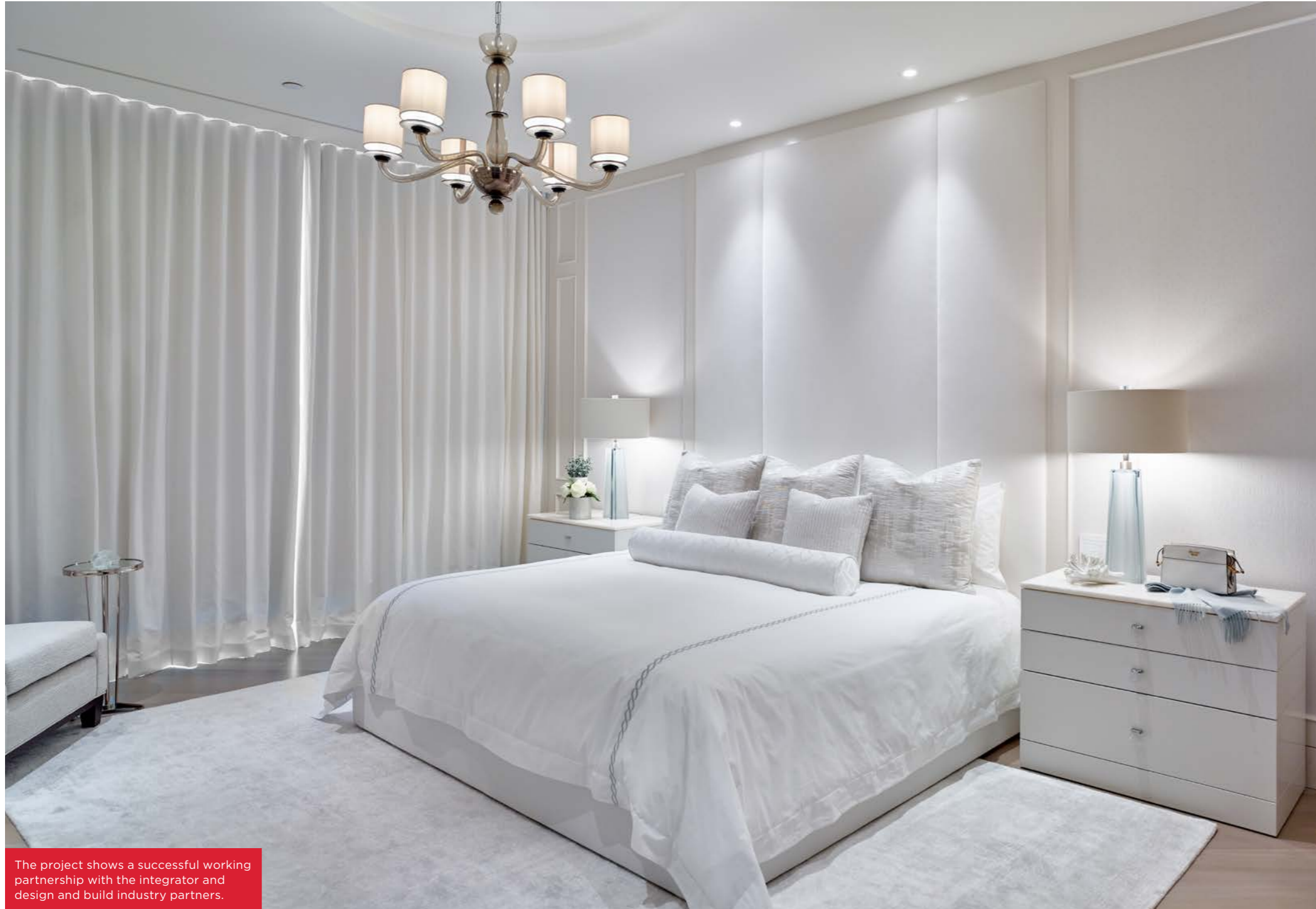
The project shows a successful working partnership with the integrator and design and build industry partners.